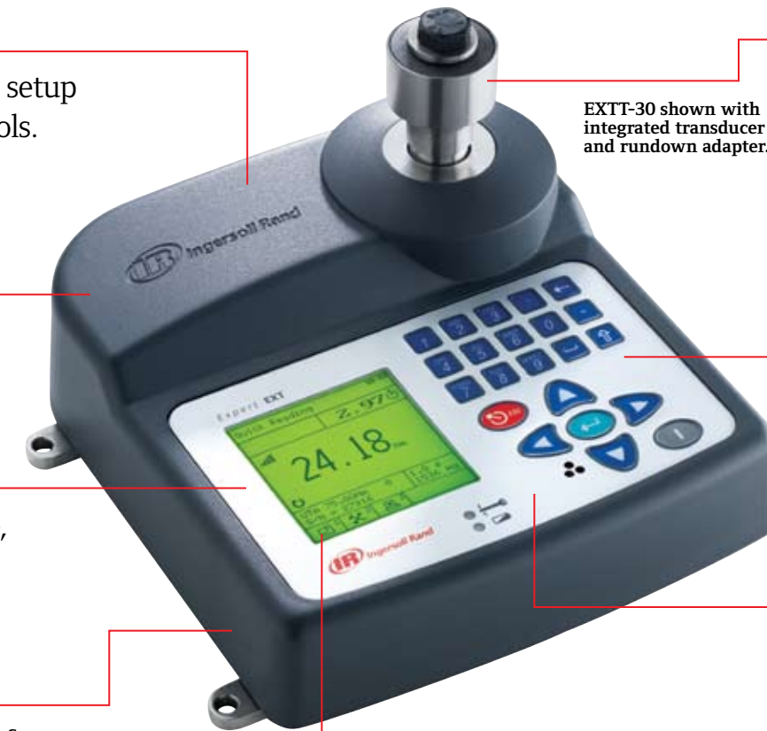
EXTT-30 shown with integrated transducer and rundown adapter.

Compact and lightweight with rechargeable battery provides ease of use and portability on the assembly line and space savings on the workbench.